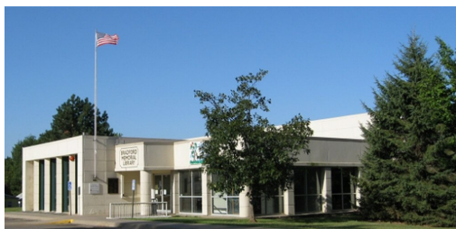
Bradford Memorial Library 611 S. Washington El Dorado, KS 316-321-3363 http://bradfordlibrary.info

All activities take place in the Clymer room on the lower level of the library. Children under the age of seven must be accompanied by an adult while at the library. For more information, call 321-3363 or visit Library Kids, http://bradford.mykansalibrary.org .