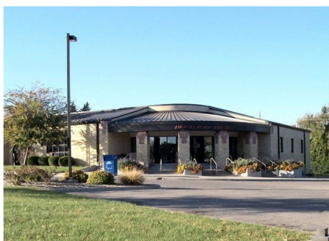
Augusta Public Library 1609 State Street

Our friends at the Augusta Public Library will begin their Fall Story Time and Toddler Time sessions soon.